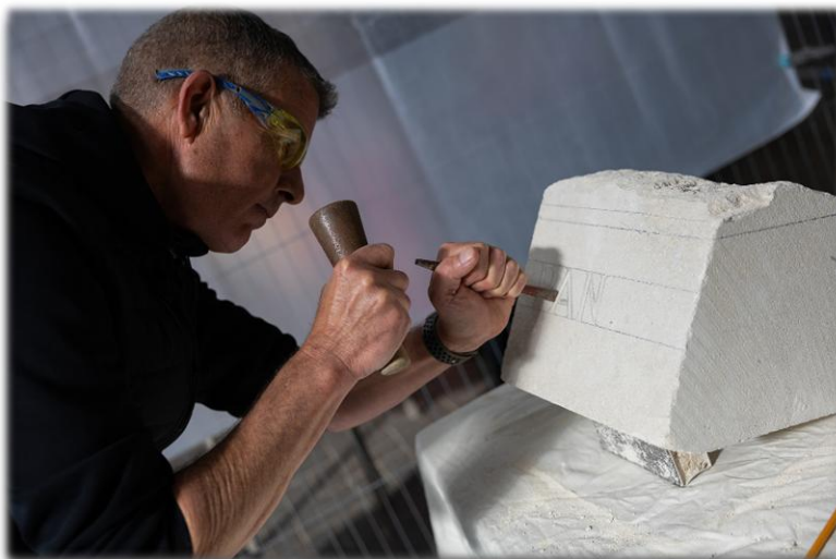
Local stonemason demonstration at the Barnstaple Pannier Market open day

A large-scale open day at Barnstaple Pannier Market in 2024 hosted demonstrations in Lime Plastering, Thatching, Blacksmithing, Stonemasonry, Leadwork and Dry Stone Walling. The experts answered questions about the work they do, careers in the sector and advice about how to maintain historic properties. There were also stands to deliver advice and guidance on skills and training, and business support.