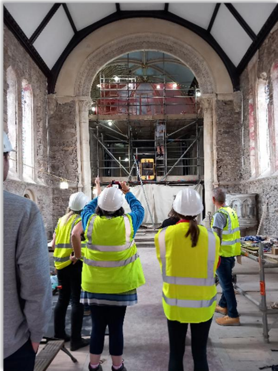
St Mary's Church restoration, Lime Plastering workshop

Recognised in the Government's Levelling Up strategy, historic buildings play an important role in society. They are also an important source of economic prosperity and growth. It is estimated that North Devon needs another 260 full time equivalent (FTE) workers on average per year, to support an estimated direct economic output of £32,200,000. An ageing workforce and lack of training opportunities has led to a sharp decline in the traditional building and heritage skills sector, putting the future of historic buildings at risk